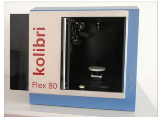
3D measuring system kolibri Flex 80